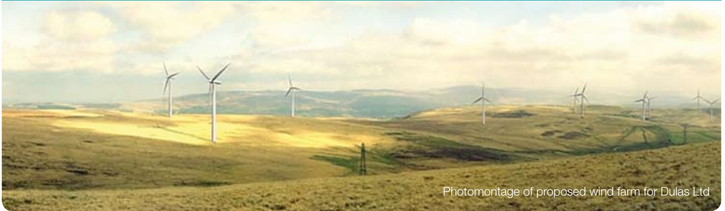
Photomontage of proposed wind farm for Dulas Ltd

Citrine UK Ltd is a regular customer to emapsite for terrain height data and mapping such as OS raster maps and aerial photography, which are often used in the preparation of before and after photomontages and visibility analyses for wind farm projects.