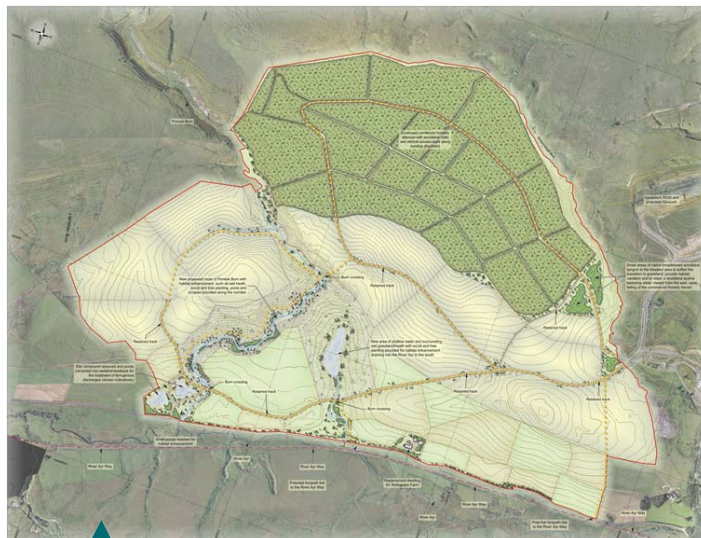
The restoration plan for the Ayrshire site shown through mapping overlaid onto aerial photography